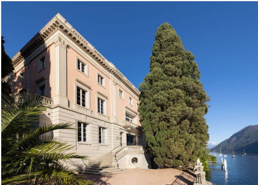
Exterior view of the new Bally Foundation headquarters, inside the meticulously restored 1930s Villa Heleneum on Lake Lugano, Switzerland