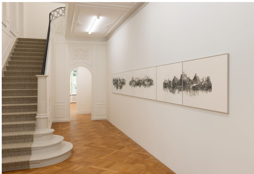
H  l  ne Muheim, Horizon - R  manence - 11 , 2022. Exhibition view of 'Un Lac Inconnu', Bally Foundation, Lugano, Switzerland, 2023

Spread across the villa's three storeys and garden, the show is filled with artworks that oscillate between internal narratives and their poetic, physical expression, such as Petrit Halilaj and Álvaro Urbano's forsythia flowers, or H  l  ne Muheim's delicate drawings made with eyeshadow and graphite powder. A series of gossamer silk works on a loom by young French artist Elise Peroi depict imaginary natural landscapes, whereby some parts are kept unwoven, letting the negative space be filled in by the viewer's own connotations.