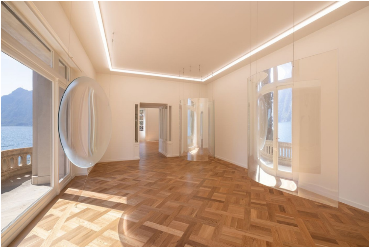
Mel O'Callaghan, Respire, Respire , 2019. Exhibition view of 'Un Lac Inconnu', Bally Foundation, Lugano, Switzerland, 2023