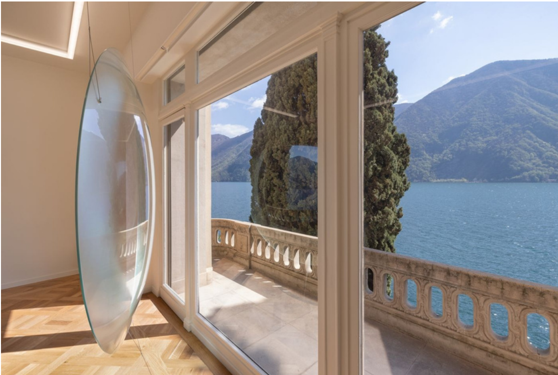
Mel O'Callaghan, Respire, Respire , 2019. Exhibition view of 'Un Lac Inconnu', Bally Foundation, Lugano, Switzerland, 2023

The Bally Foundation inaugurates its new headquarters in a 1930s villa overlooking Lake Lugano, Switzerland, with the group show 'Un Lac Inconnu' (An Unknown Lake)