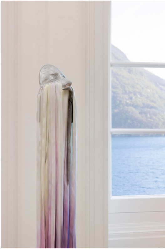
Adelaide Fériot, Rayon vert , 2021. Exhibition view of 'Un Lac Inconnu', Bally Foundation, Lugano, Switzerland, 2023 (Image credit: Andrea Rossetti) copyright Bally)