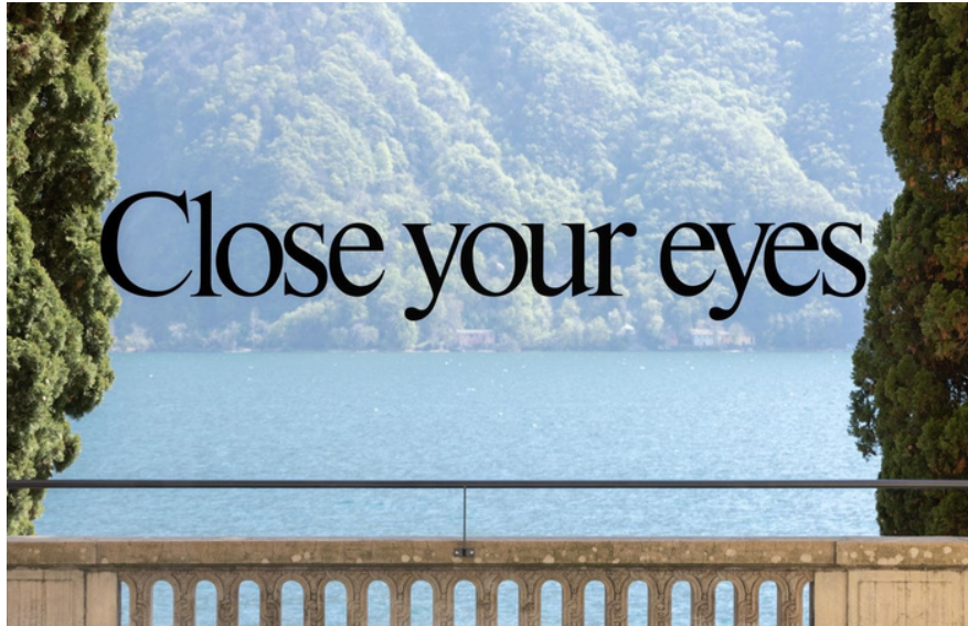
Haim Steinbach, Close your eyes, 2003. Exhibition view of 'Un Lac Inconnu', Bally Foundation, Lugano, Switzerland, 2023